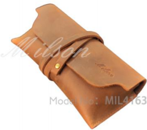
MIL4163 172*84*38 MM