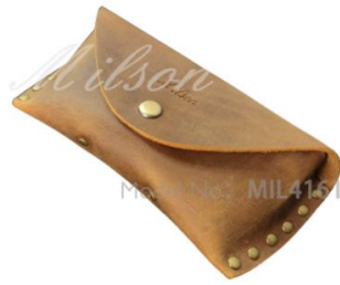
MIL4161 172*78*49 MM