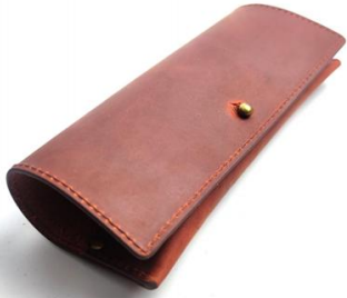
MIL4155 177*68.5*37 MM