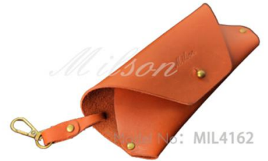
MIL4162 169*72*32 MM